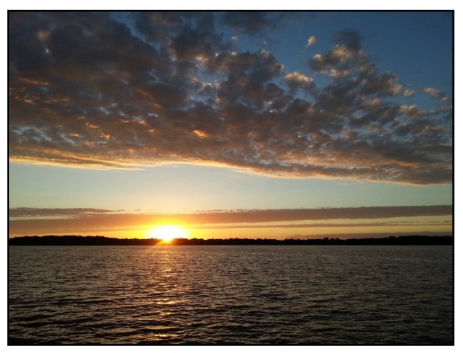
Beautiful sunset on Thursday evening during our conference Lake Minnetonka cruise