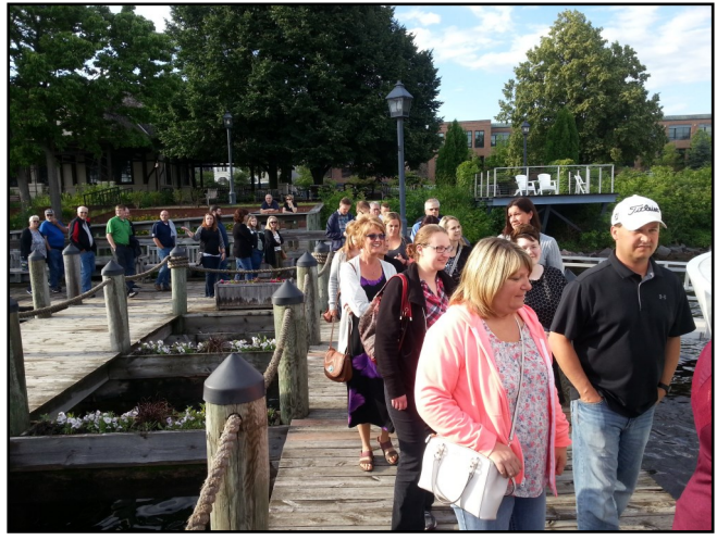
Loading the Lake Minnetonka yachts for the dinner cruise